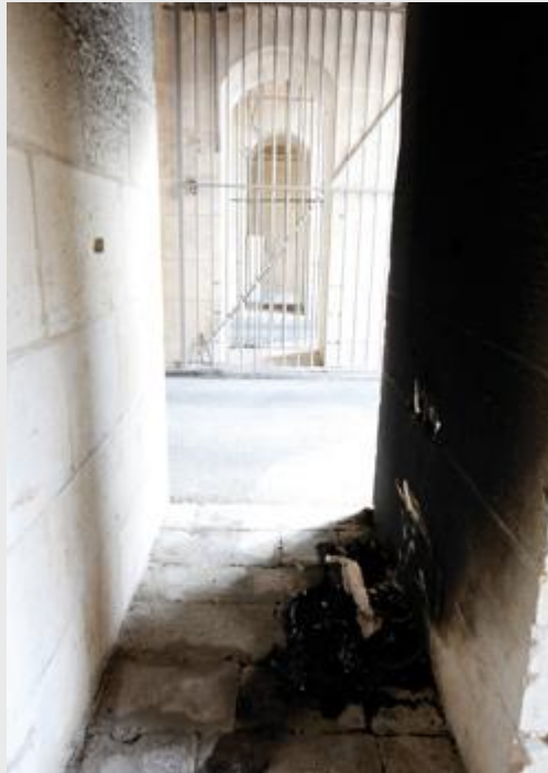
Vandals attacked the recently-restored Victoria Gate, Valletta which was coated in soot after material was burnt right next to it.

The recently restored Victoria Gate in Ta' Liesse, Valletta was vandalised sometime between Thursday and yesterday when material was placed beneath its arch and set on fire.