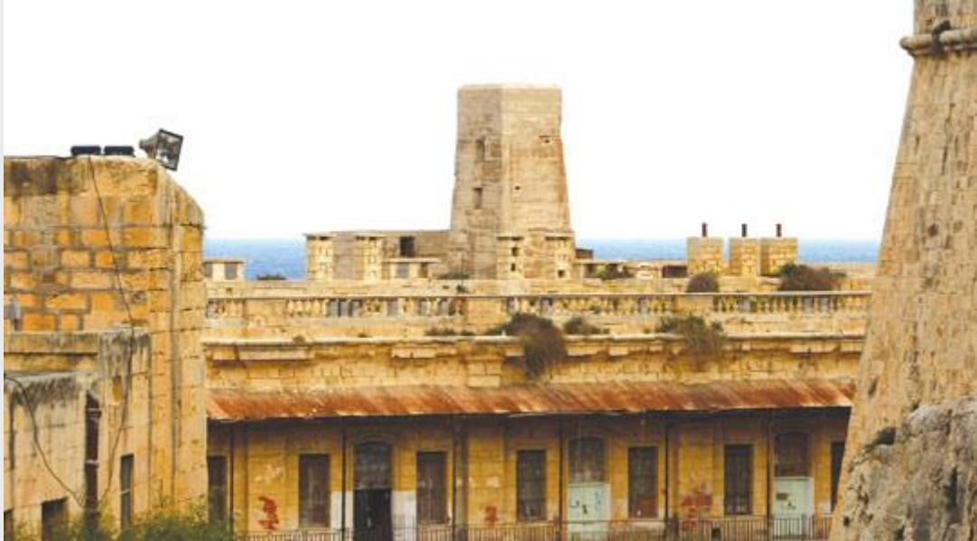
Fort St Elmo is in a very bad state of repair.

Plans to transform Fort St Elmo in Valletta into a tourist venue are positive but they have to be economically viable to ensure long-term success, according to hoteliers.