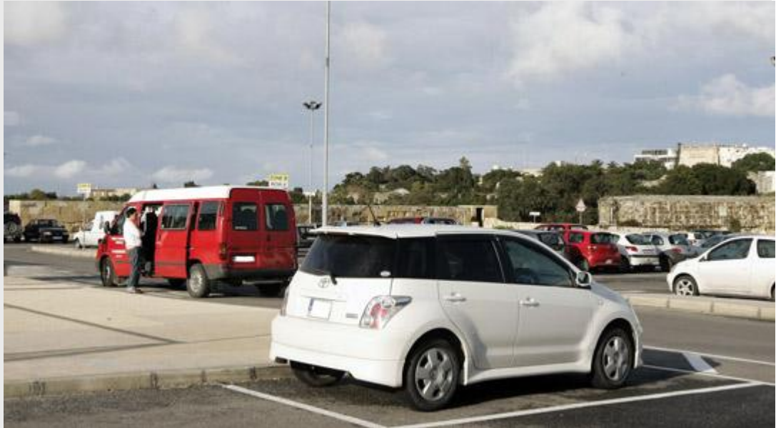
The park and ride service into Valletta may soon come at a charge.

Motorists travelling into Valletta may have to pay to use park and ride transport into the capital, a service that has been free ever since it was introduced four years ago.