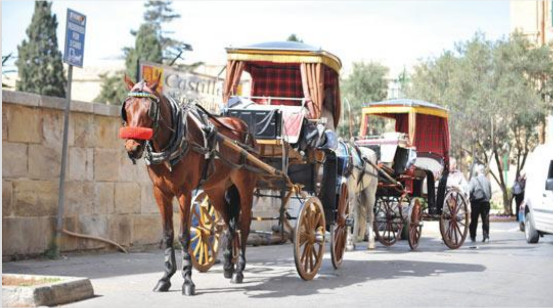
Horses are forced to wait for business in the heat without any shelter.

It is a pity that infrastructure issues related to building shelters for karozzini horses are overshadowing the welfare of the animals, according to a group of animal rights' organisations.