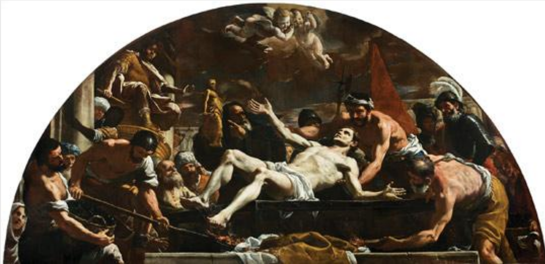
St Lawrence restored.

The beautiful and majestic chapel of Aragon at St John's Co-Cathedral, Valletta, has been given a deep facelift with the grime and soot of years cleared as part of a major restoration project.