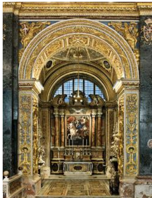
Chapel of Aragon.