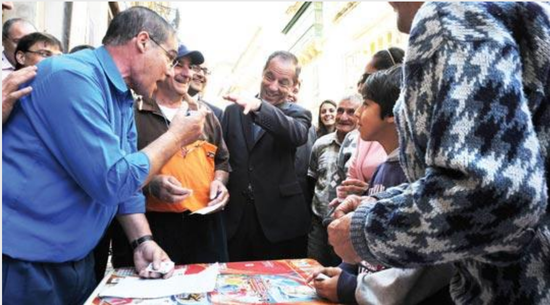
Prime Minister Lawrence Gonzi (centre) took time to exchange taunts with football enthusiasts exchanging stickers outside the Anastasi outlet in Merchants Street, Valletta, yesterday.

Over 20 shops opened in Merchants Street, Valletta since its re-paving and pedestrianisation two years ago, according to shop owners.